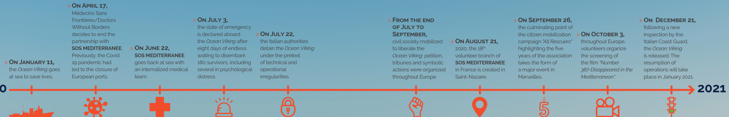
Flavio Gasperini / SOS MEDITERRANEE